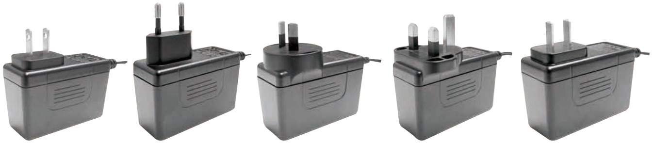
FIG 1: American